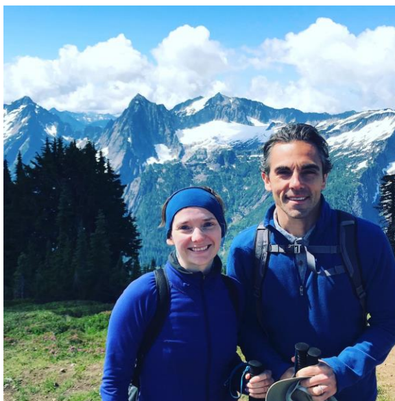
-My husband and me at the summit of Mt. Dickerman in the Mount Baker-Snoqualmie National Forest