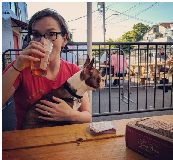
-Enjoying a few of my favorite things: dogs, craft beer, and trivia at Lucky Envelope Brewing in Seattle

I'm grateful for our Apra-NW community, and I hope you are, too. I encourage you to make the most of your membership: participate, make use of our resources, ask questions, volunteer, and share your knowledge and experience! I look forward to connecting with more of you over the next year, and hope to see you in Seattle at our spring conference in May 2019!